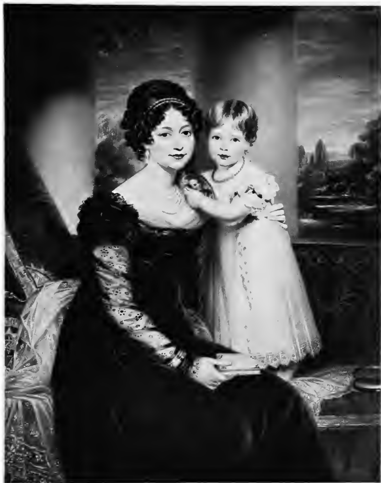
T. R. H. The Duchess of Kent and Princess Victoria. From the miniature at Windsor Castle by H. Bone after Sir W. Beechey.